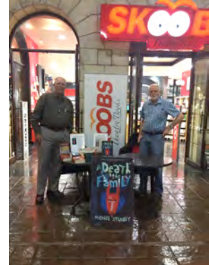
Ready for action at Scoobs