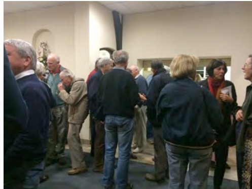
With the Park Views group in Johannesburg