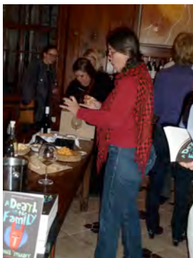
At the Pendock Wine Gallery