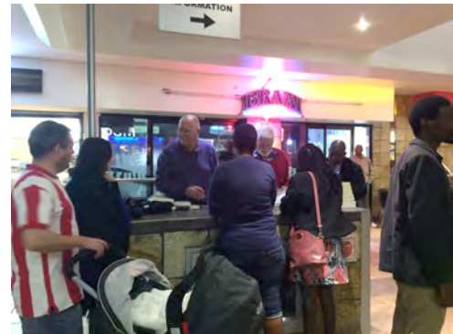
Hustling passers-by in Riverwalk Mall, Gaborone

Follow us on FaceBook at www.facebook.com/MichaelStanleyBooks