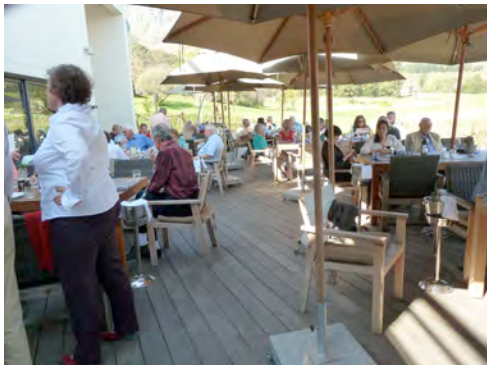
Mont Marie restaurant in Stellenbosch