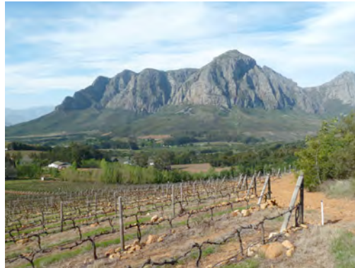
The stunning view from Mont Marie