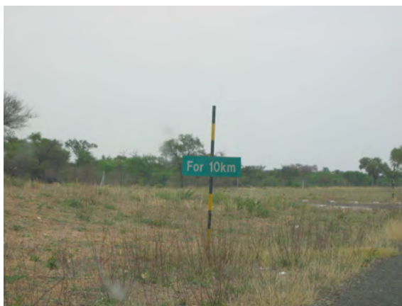
The Kalahari is so exciting that the signs tell you how far it is to nothing!