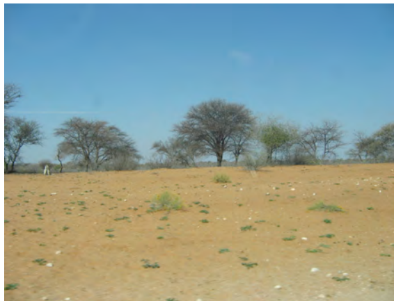
The Kalahari Desert

We had a great dinner at the NICE restaurant in Windhoek (NICE = Namibian Institute for Culinary Education). It's an excellent restaurant – with amazing photos of chefs in the desert.